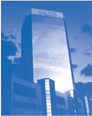
EXHIBIT at the 2010 NJ PTA CONVENTION

November 19 & 20 Bally's Atlantic City Atlantic City, NJ